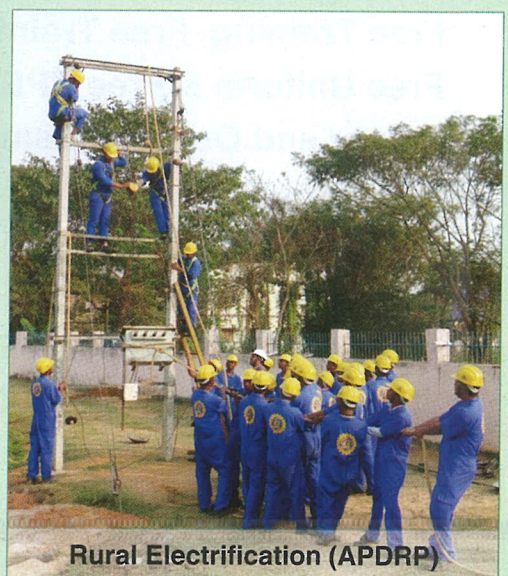
Rural Electrification (APDRP)