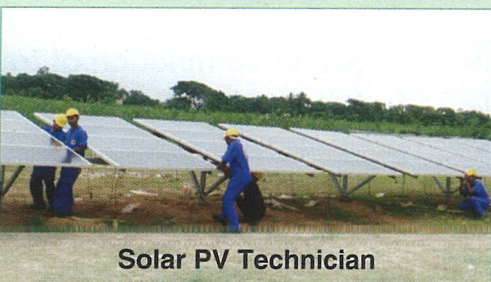
Solar PV Technician

LARSEN & TOUBRO LIMITED CONSTRUCTION SKILLS TRAINING INSTITUTE At: Balikuda, Po: Gopalpur, Cuttack-753011, Odisha