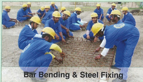
Bar Bending & Steel Fixing